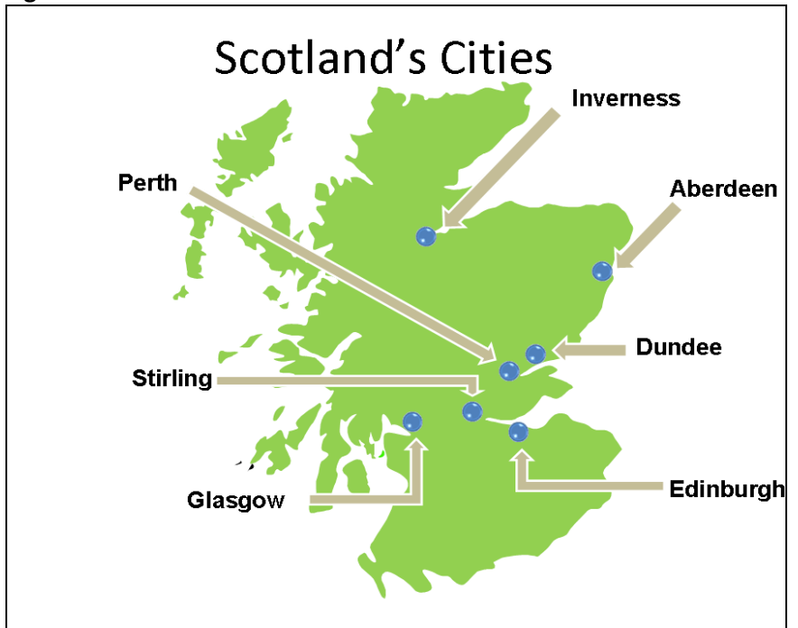
Figure 1 – Scottish Cities Alliance - 7 Cities locations.

Through the partnership with the <u>Scottish Cities Alliance</u>, the cities in Glasgow's Learning Network as part of the STEP UP project are the six Scottish cities of Aberdeen, Dundee, Edinburgh, Inverness, Perth and Stirling (Figure 1). All of these cities are historic settlements, are of varying sizes and populations and display a wide range of characteristics with respect to energy. All of the cities except Inverness (part of Highland Council) and Perth (part of Perth and Kinross Council) have political administrations at a city level and are also subject to devolved legislation in Scotland from the Scottish Parliament in Edinburgh and national legislation from the UK Government in London. All except Inverness are also included in a Strategic Development Plan (SDP) area designated by the Scottish Government (Figure 2) for strategic spatial planning purposes for the largest city-regions.